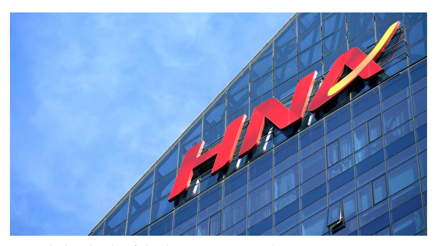
HNA battles with creditors for breathing space to restructure.

Los-Angeles-headquartered Oaktree, Boston-based Bain Capital, China's Citic Capital and others have amassed funds and assembled specialist debt teams for just such a calamity. Such investors have raised US$10.6 billion over the last two years, said data provider Preqin.